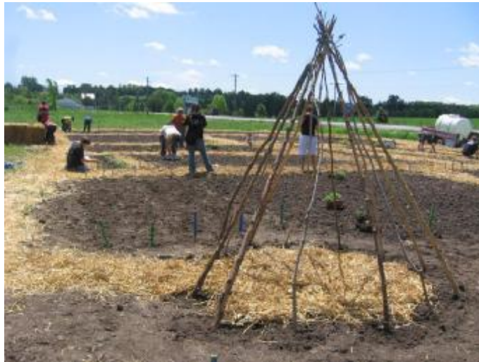
Some of the Volunteers at the “Garden of Eatin” at St Paul’s Leaskdale

As the busy holiday season approaches, wouldn’t it be great if we decided that instead of spending a day shopping for gifts, we would volunteer in the community instead? These tough economic times have been hard on a lot of us, we could all benefit from cutting back on our spending. Instead of giving a wrapped gift for the holiday, why not give a gift of your time? Maybe your whole family could get involved together, have a family meeting, think about what organization in your area you feel could use your help. Maybe you know someone who has benefited from an organization in your community; you could volunteer some of your time to help that organization. This year lets all think about giving the gift of our time, it is the most precious gift of all.